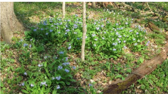
Wildflowers, Bartlett Woods, Lee County

Luckily some lovely areas remain and this is the time to take a walk through your local woodland. The important word to remember is ephemeral. Don't think you can procrastinate on this task for if you do, you'll miss the show. Best case scenario is to visit your special site each week from April through mid-May. You'll witness an on-going change as certain flowers explode into bloom, and then disappear almost in a day. In a biological sense, the wildflowers take advantage of the leafless state of the trees; the flowers absorb every drop of sunshine that shines through the bare branches. Once the full canopy of leaves is in place for the summer, the spring ephemerals are locked away, safely underground, growing strong