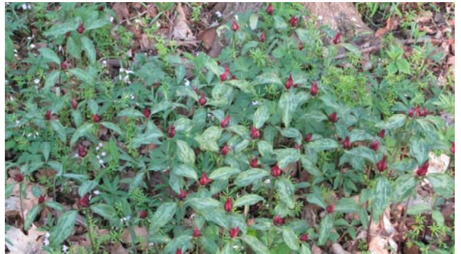
Trilliums in Bartlett Woods, Lee County

The past few human generations have grown up with the mental idea that a woodland is a brushy, somewhat impassable area. Since well-meaning people - yes, even natural resource professionals like us! - suggested and promoted planting non-native honeysuckle in the 1950-60 era as wildlife habitat, our woodlands have been smothered with an onslaught of aggressive and brash honeysuckle. Where once you could walk unimpeded through a woodland, staring in awe at gigantic oaks, you now thrash through a maze of honeysuckle. The truly unfortunate thing is that the honeysuckle eventually replaced the forest floor component of spring ephemerals - those lovely and singularly special lady slipper orchids, Dutchman's breeches, trilliums, blood root, spring beauties, jack-in-the-pulpit and Jacob's ladder plants. And these are but a smattering of the diversity of wildflowers once covering every inch of the woodlands in our state.