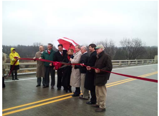
Ribbon Cutting Ceremony December 15, 2012

Editors Note: This is the second Fox River bridge project in which the Kane-DuPage SWCD staff has played a significant roll in helping to assure that the construction schedule remained on time and on budget. Great work folks!