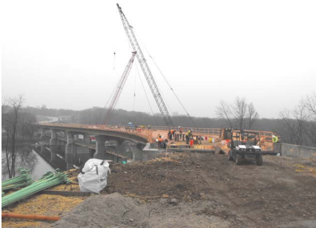
Bridge Construction November 2012

This 31 million dollar project started in August of 2011. The bridge provides a two lane vehicular traffic crossing as well as a suspended pedestrian bridge underneath. A traffic study done the week after the bridge opened counted 5,198 vehicles using the bridge during a 24 hour period. This bridge will provide yet another route across the Fox River to help relieve congestion in downtown St. Charles. Added benefits include a more timely response for emergency vehicles; shortening the distance between the two high schools in St. Charles, and reduced travel time for commuters.