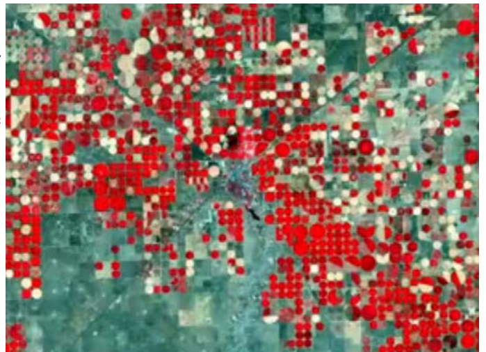
A water-rich polka dot pattern has taken over the traditional rectangular patchwork of fields.

This series uses data from four Landsat satellites. Shown in this false color composite is light reflected from the near-infrared, red, and green regions of the electromagnetic spectrum (bands 4, 2, and 1 from the Multispectral Scanner Systems (MSS) aboard Landsat 1, 2, and 4, and bands 4, 3, and 2 from the Thematic Mapper (TM) aboard Landsat 5).