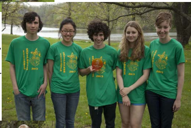
Third Place Team Spoon River Valley High School, London Mills, IL

Fulton County Soil and Water Con- servation District