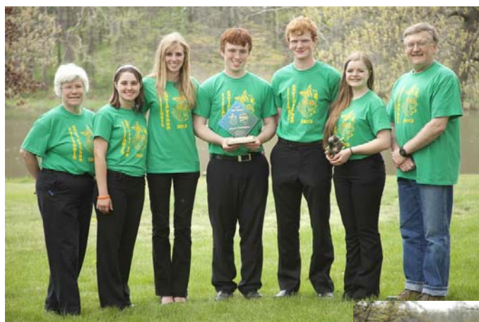
First Place Team Triad High School, Troy, IL

Madison County Soil and Water Conservation District