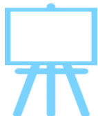
Exhibit Hall Vendors

Award applications and forms will be on the AISWCD website no later than March 15th. Registration forms will be available online April 1st.