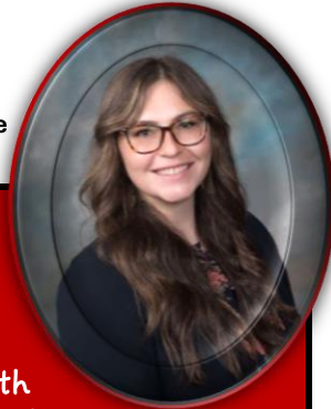
Lead Organizer Illinois Stewardship Alliance